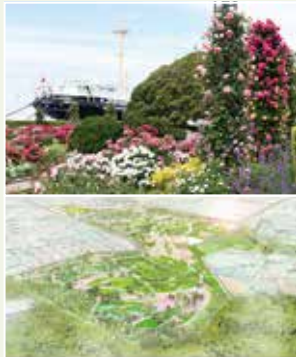
Sketch of the International Horticultural Expo 2027 venue (International Horticultural Expo 2027, Yokohama)

By registering for the Garden Tourism program, it aims to expand its network with hotels and restaurants to further boost the appeal of Yokohama as a city of flowers and greenery and to invite many people worldwide for the World Horticultural Exhibition in 2027.