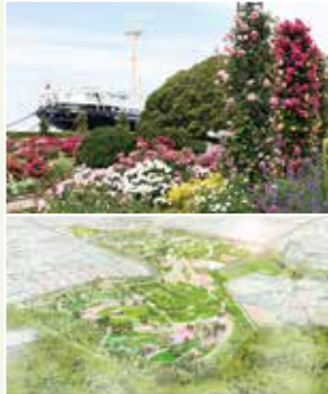
Sketch of the International Horticultural Expo 2027 venue (International Horticultural Expo 2027, Yokohama)

By registering for the Garden Tourism program, it aims to expand its network with hotels and restaurants to further boost the appeal of Yokohama as a city of flowers and greenery and to invite many people worldwide for the World Horticultural Exhibition in 2027.